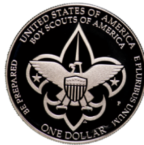
Lot 3: 2010-P Boy Scouts of America Centennial Silver Dollar; Proof, in Original Government Packaging