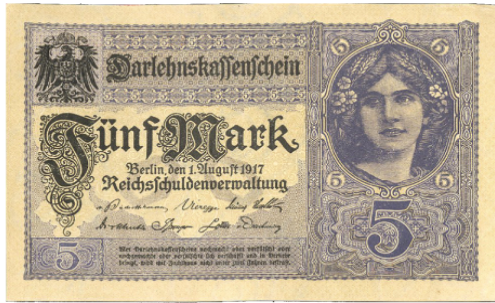
Lot 2: August 1, 1917 Germany 5 Mark "Darlehnskassenschein" (Loan Receipt) Note; Extremely Fine